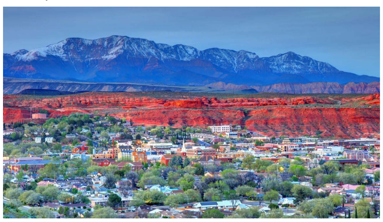
St. George, Utah.

Like much of the Western U.S., Southern Utah is home to a massive federal presence. An estimated 75 percent of the land in Washington County is federally owned, with only 16.5 percent of its territory in private hands. Local officials describe Washington County as