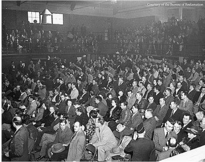
Picture 1: Klamath Homestead Drawing on December 18, 1946

operations in connection with a federal irrigation project. 4 Upper Klamath Lake is the largest freshwater body by surface area west of the Rockies 5 , with a surface area of more than 91,000 acres when full and active storage capacity of 562,000 acre-feet. 6