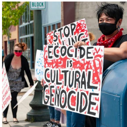
Picture 2: Klamath Tribes Rally Amid Water Crisis