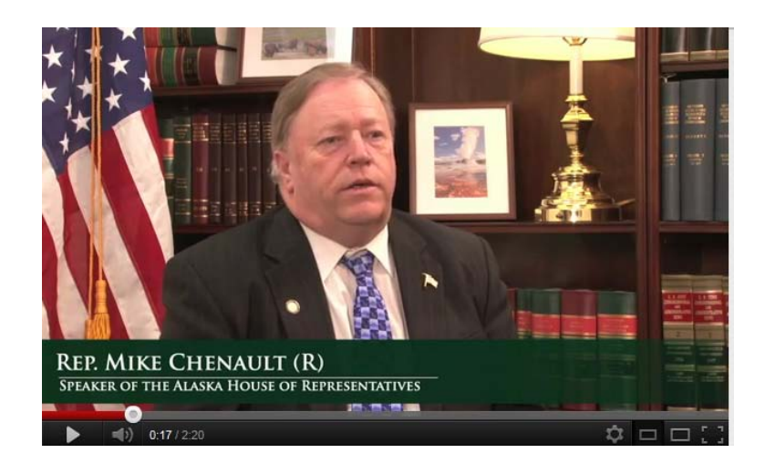
Part III: What Energy Development in ANWR Means to the Environment